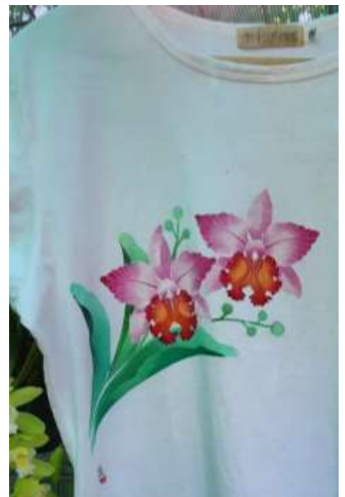
ABOVE: Tracy Whitbread watched this t-shirt being handpainted in Chiang Mai, Thailand, about 12 years ago. It turned out to be quite a bit more expensive than she expected but it's a keeper.