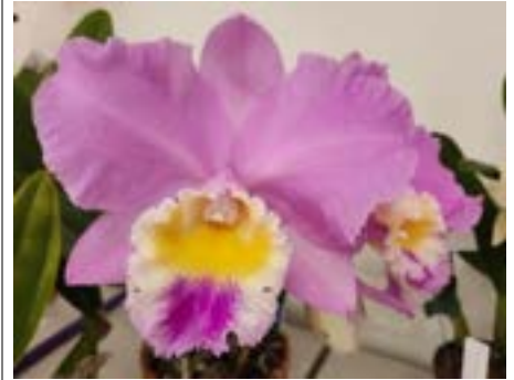
Cattleya Exhibition over 100mm R/c. Deception Dawn T & C Cook