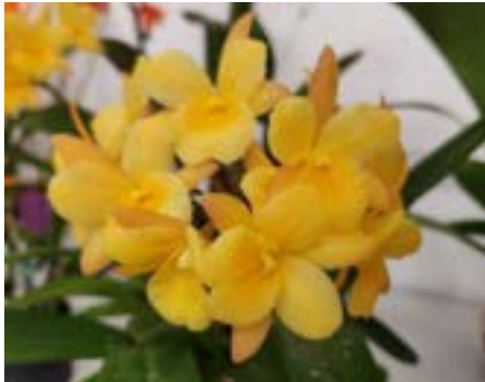
Cattleya Cluster Ctna. Why Not 'Yellow' L. Walters