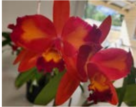
Cattleya Interm. 70-100mm Ctt. Aussie Sunset 'Cosmic Fire' D Phillips